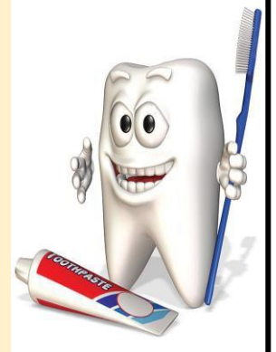
Youth Health Bulletin April 2009