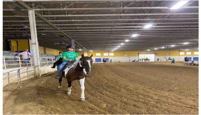
4-H Horse Club member participating in the Fun Show at Morehead State University Farm.

these shows demonstrated their commitment to horsemanship and personal growth.