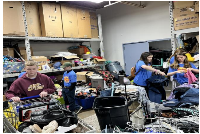
4-H'ers sorting donations as part of their service project with The Neighborhood .

The students gained valuable insights into the challenges faced by the homeless community and learned about the importance of giving back. The service project was a powerful experience that not only benefited The Neighborhood but also fostered a sense of responsibility and empathy among the students. Feedback from the retreat highlighted