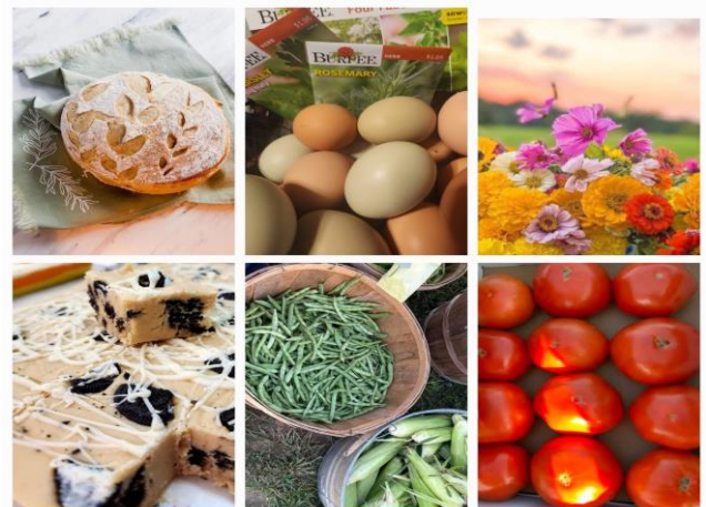
Some of the products offered by local vendors for the 2024 season.

What truly set this market apart was the collaborative effort behind its creation. The market manager and local agents worked to build relationships with stakeholders at both county and state levels. This ensured the market's sustainability and success, as these partnerships provided vital resources, marketing support, and visibility for the market in its inaugural season.