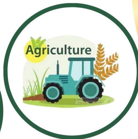
Agriculture & Natural Resources

Did you know? Rowan County was formed from parts of Fleming and Morgan Counties on May 1, 1856.