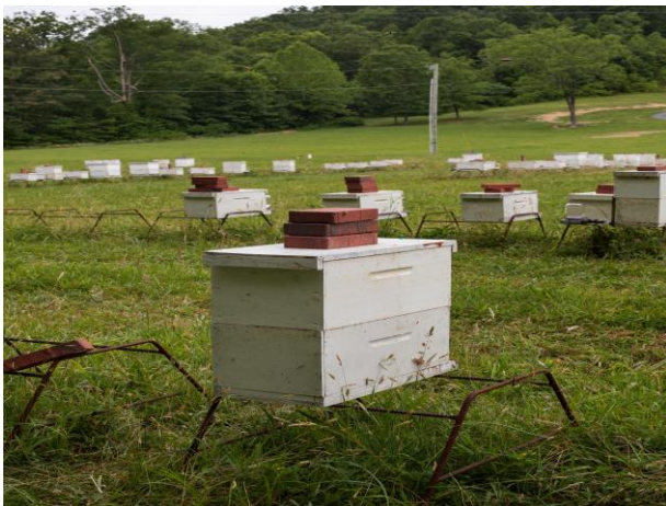
Local beekeeping operation in the county as part of the Homesteading movement.

In recent years, there has been a growing interest in sustainable living, self-sufficiency, and backyard farming. One such initiative, the Homesteading Program, provides participants with the knowledge and hands-on experience necessary to engage in self-sufficient practices. This report highlights the key components of a recent homesteading program, which included raised bed gardening, beekeeping, backyard poultry, and canning 101. The program offered practical solutions for those interested in growing their own food, managing livestock, preserving harvests, and building a more sustainable lifestyle.