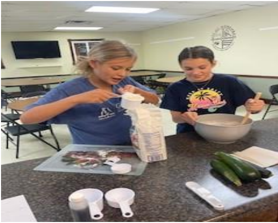
Learning to measure the ingredients was so much different than using a premeasured box mix.

Our second adventure was baking quick breads. Quick bread is without yeast, using leavening agents like baking powder or baking soda. This makes them faster to prepare than traditional breads. Examples of quick breads include banana bread, zucchini bread, muffins, and scones.