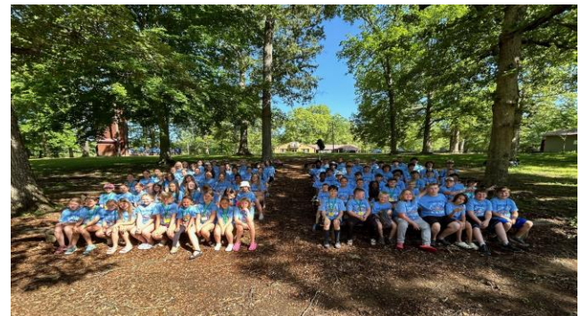
101 4-H'ers attended 4-H Camp in 2024.

Rowan County was ready to gear up for the Best Week of the Year - 4-H Camp! 4-H Camp in 2024 hit a record total since COVID of 101 attending.