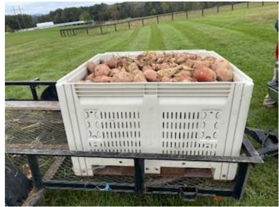
Sweet potatoes are one of your highest nutritious value vegetables that we can grow.

FCS Agent and the FFA Members grow sweet potatoes free of charge for senior citizens in Eastern KY. The project began with serving only Rowan County residents and has expanded to nine Eastern Kentucky counties: Bath, Bracken, Carter, Elliott, Fleming, Mason, Menifee, Morgan and Rowan.